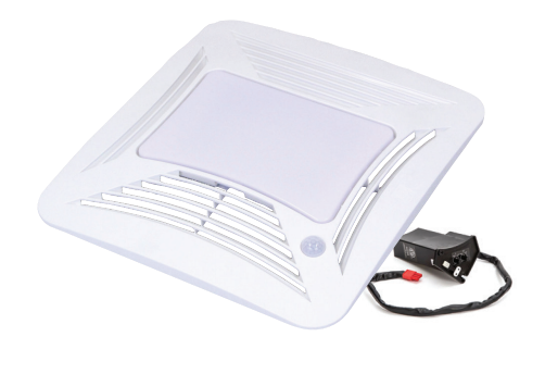
Lighted Motion and Humidity Sensing Grille Kit -