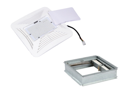
LED LIGHTED GRILLE AND RADIATION DAMPER KIT PCLEDKRD/PCLEDKRDP