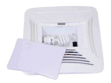
CFL Lighted Grille Kit -