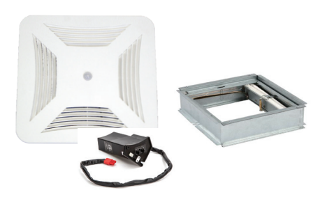
MOTION AND HUMIDITY SENSING GRILLE AND RADIATION DAMPER KIT PCMHKRDP