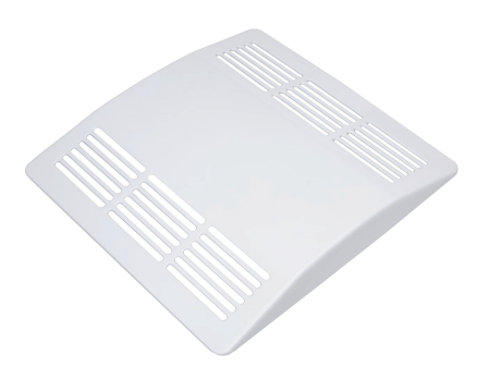
METAL GRILLE -