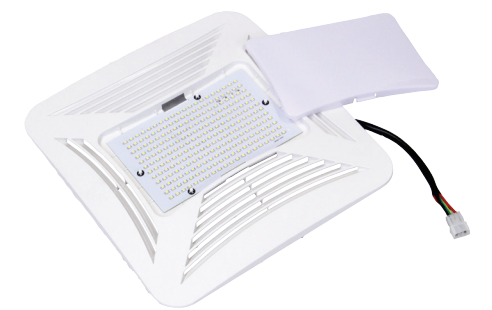
LED Lighted Grille Kit-