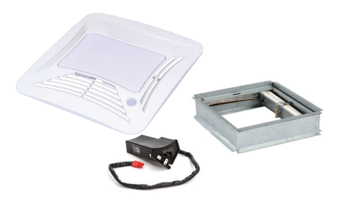
LIGHTED MOTION AND HUMIDITY SENSING GRILLE AND RADIATION DAMPER KIT PCDLMGRDP