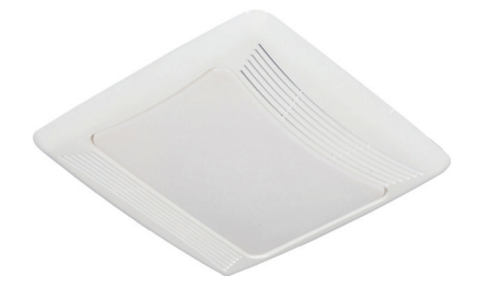
CFL Lighted Grille Kit for PC Value- PCVLK