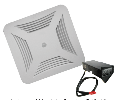
Motion and Humidity Sensing Grille Kit -