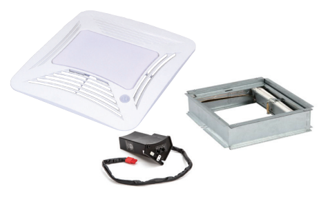
LIGHTED MOTION AND HUMIDITY SENSING GRILLE AND RADIATION DAMPER KIT PCLMHKRDP